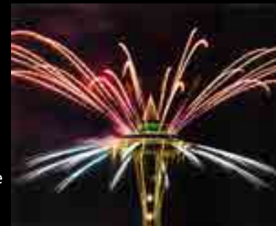
Space Needle, Seattle, WA

Yes absolutely. We have created a 1.4G Consumer version that has been tested in accordance to CPSC regulations and can be used in your back yard shows. As a matter of fact the devices are the exact same excluding the E-Port. These devices can be shot utilizing a consumer grade firing system or by simply using your back yard creativity. Either way they're the exact same size & effects utilized within a Pyro Spectaculars by Souza Show.