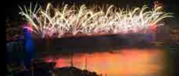
Brooklyn Bridge, New York City, NY

We look back with pride at our heritage. From community events to shows on the world's largest stages, the Souza family's commitment to excellence continues. Now we're committed to making the best fireworks shows in the world even better. We'll continue to push the possibilities of what is possible with fireworks in our quest to bring entertainment to people around the world. It's our way of providing joy to people on every continent. It's why we are the fireworks ambassadors of the world.