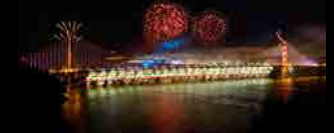
Golden Gate Bridge, San Francisco, CA

Pyro Spectaculars by Souza has partnered with Fireworks Over America as the exclusive distributor. By simply filling out the proper paperwork you can purchase either version that suits your operation from an FOA Distributor.